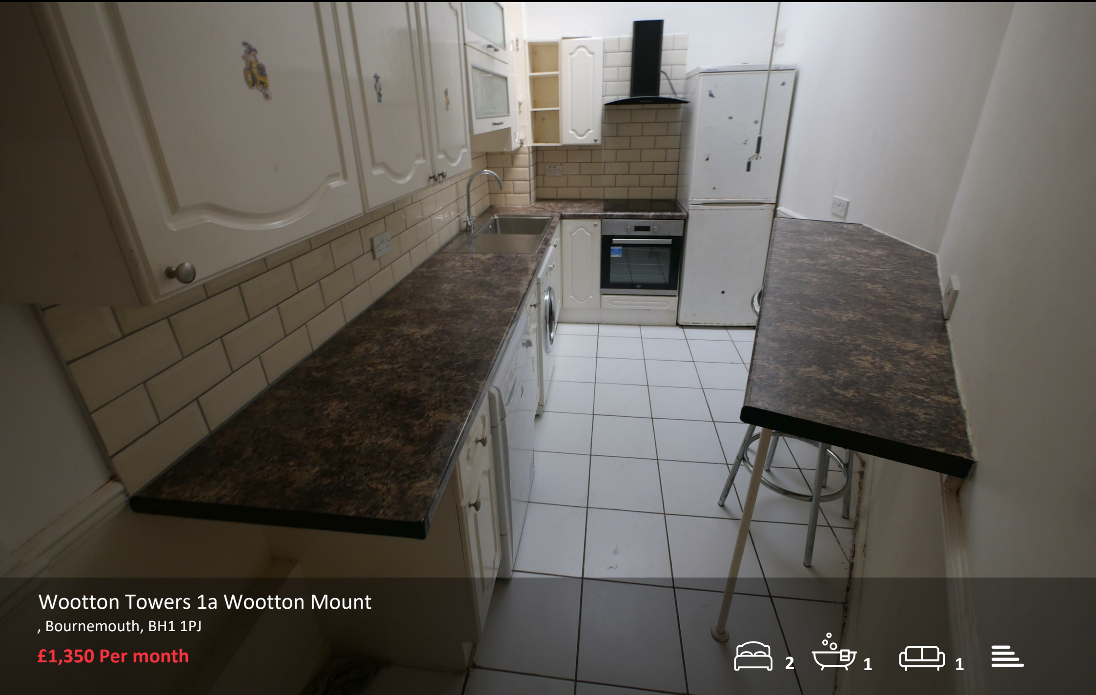
Wootton Towers 1a Wootton Mount , Bournemouth, BH1 1PJ